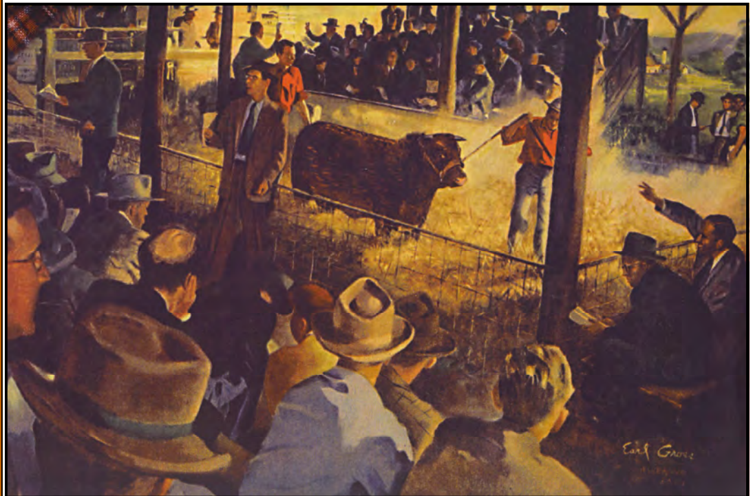
Kentucky Cattle Auction painted for the Early Times Collection by Earl Gross. The painting depicts an auction at the cattle barn on Ashbourne Farm

Exhibit opens March 15, special activities March 19 Exhibit runs through December 2011