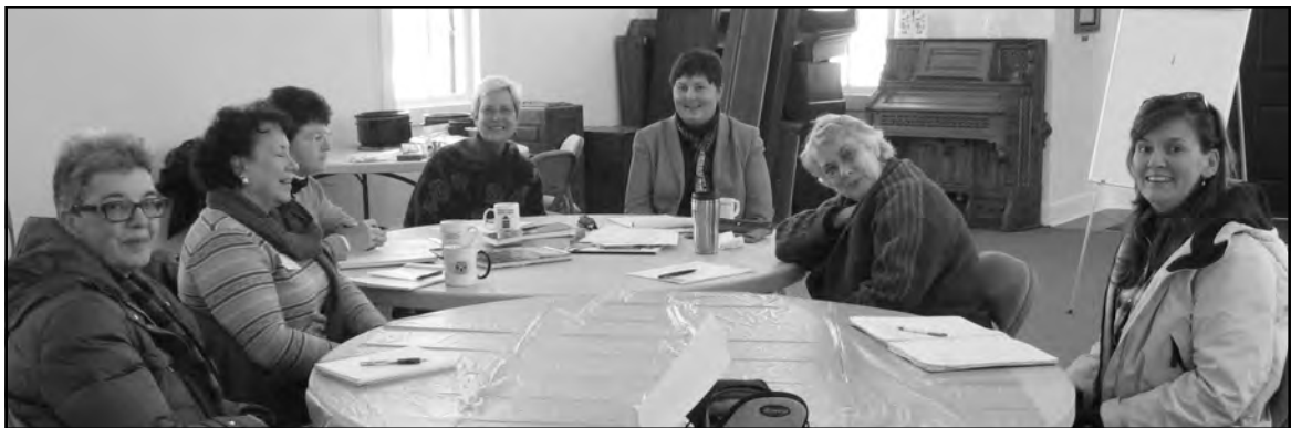
Master Gardener's on the Design Team meet to plan the Colonial Garden Project

Hand Press Linoleum Cut Valentines w/ Hound Dog Press!! Register NOW for WKSP on 2/5/11 Limit 15.