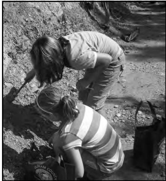
History Campers search for fossils on 18 Mile Creek as a part of this past summer's History Camp for Kids sponsored by the Head Trust

Cost: $12 for non-members/$10 for members. Call 222-0826 for reservations or email us at ochstryctr@aol.com